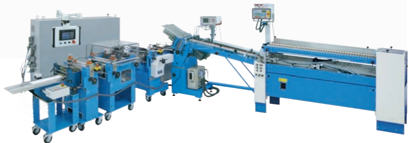
FA 43/8-4 R6 MV 2001

SPECIAL MACHINE FOR OUTSERT-PRODUCTION WITH ALL AROUND CLOSED EDGES