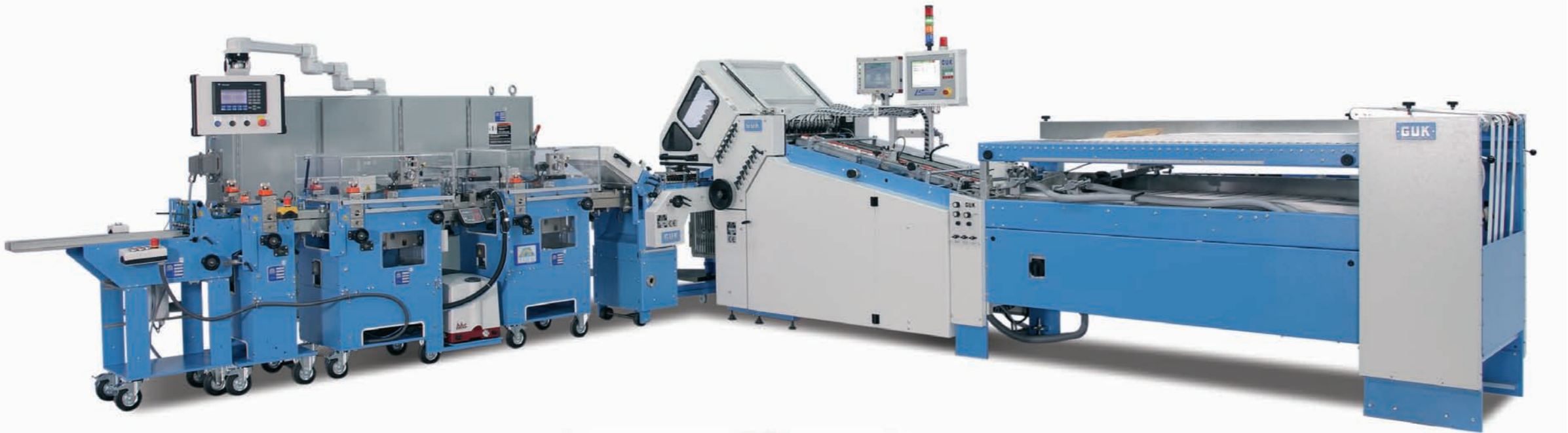
FA 53/14-4 R6 MV 2005