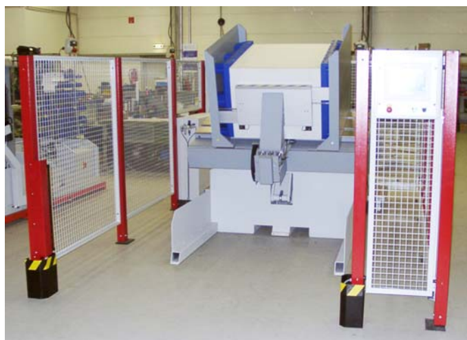
airing, aligning, jogging