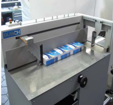
Manual insertion of product piles