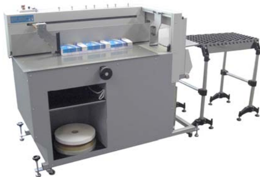
Final rear position of feed pusher

The maximum insertion length of products or product rows is 750 mm. When inserting very short products, the final rear position of the feed pusher can be adjusted to maintain a high banding output.