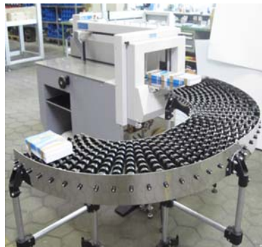
Roller delivery for the package transport (option)

The maximum insertion length of products or product rows is 750 mm. When inserting very short products, the final rear position of the feed pusher can be adjusted to maintain a high banding output.