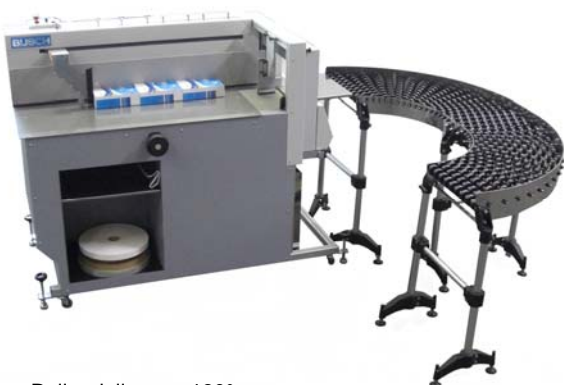
Roller delivery - 180°