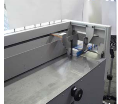
Compression and banding of product piles