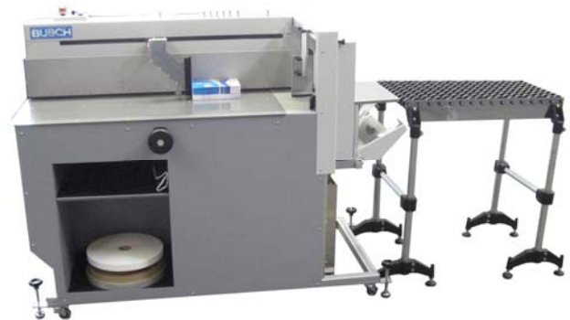
Adjusted final rear position of feed pusher