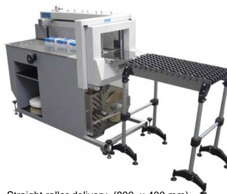
Straight roller delivery (800 x 400 mm)