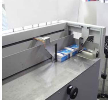
Automatic feeding of product piles